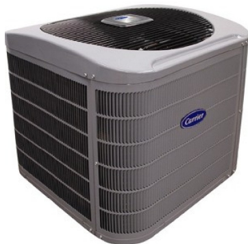
Carrier Comfort™ 13 Series Air Conditioner