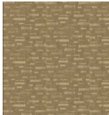
Patcraft Dazzle Carpet Tile