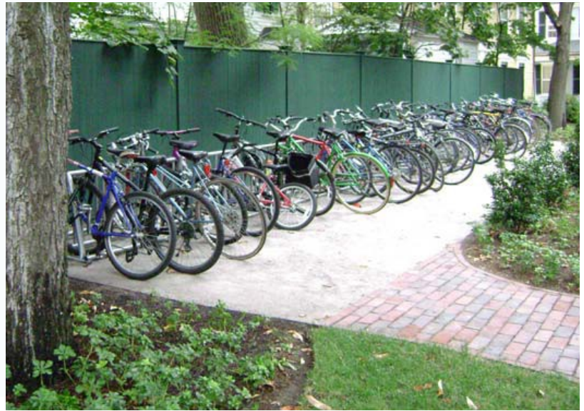
Bike Racks Outside Main Entrance