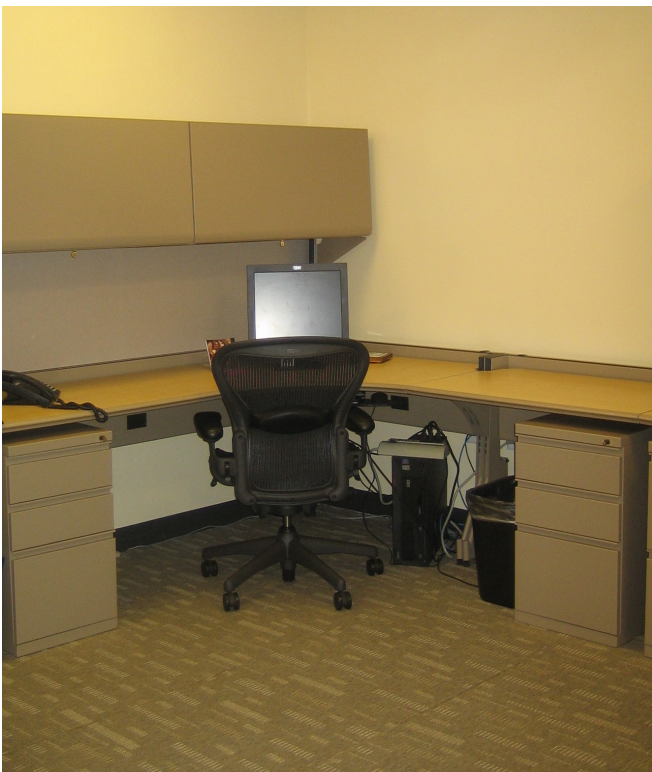
Longfellow Hall Renovation Photo: Harvard Office of Sustainability 2007