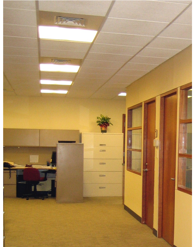
2x2 Recessed Fluorescent Lighting Longfellow Hall Basement Renovation