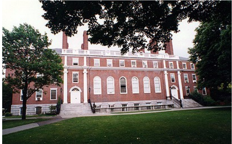
Harvard University, Longfellow Hall 13 Appian Way, Cambridge, MA