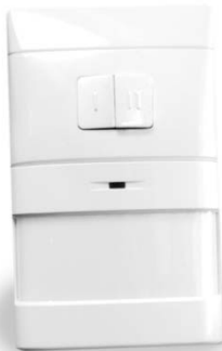
WI-300 Passive Infrared Dual Relay Wall Switch Sensor