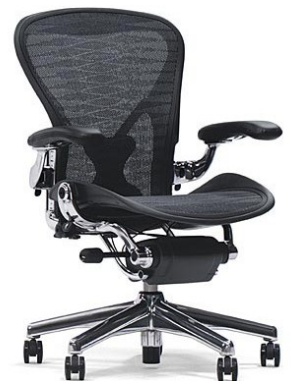
Herman Miller Aeron Chair