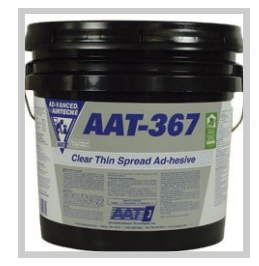
367 Clear Thin-Spread Adhesive

√ VOC Content = 0 g/L vs. 50 g/L VOC Limit