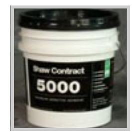
Adhesive 5000 Shaw Contract Group

√ VOC Content = 0 g/L vs. 50 g/L VOC Limit