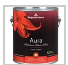
Aura Waterborne Interior Paint

√ VOC Content = 0 q/L vs. 50 g/L VOC Limit