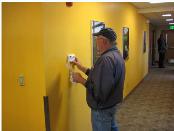
Programming the Thermostat Photo: Perry and Radford Architects. 2008