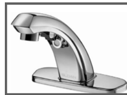
SLOAN OPTIMA Plus® ERF-885 0.5 GPM Battery Powered Wireless Faucet, Spray Head, Sensor Activated