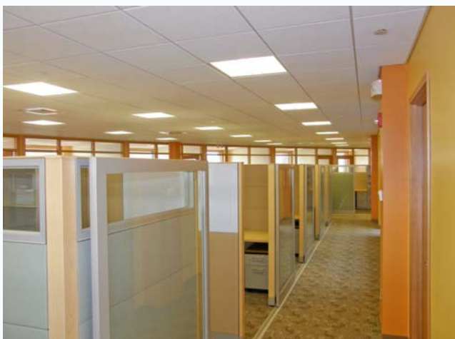
Looking down the Corridor

Thermal Comfort Survey: To ensure thermal comfort, occupants will be surveyed at least once per season for the first year of the space's operation. Building management will adjust the heating or cooling in the project space as necessary