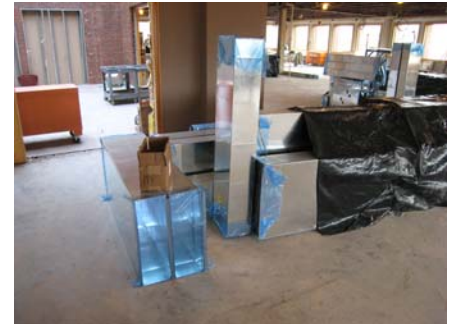
HVAC Protection: Ductwork kept sealed before installation