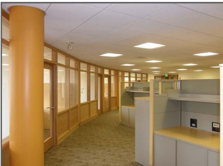
Looking down the Corridor Photo: Perry & Radford, 2008