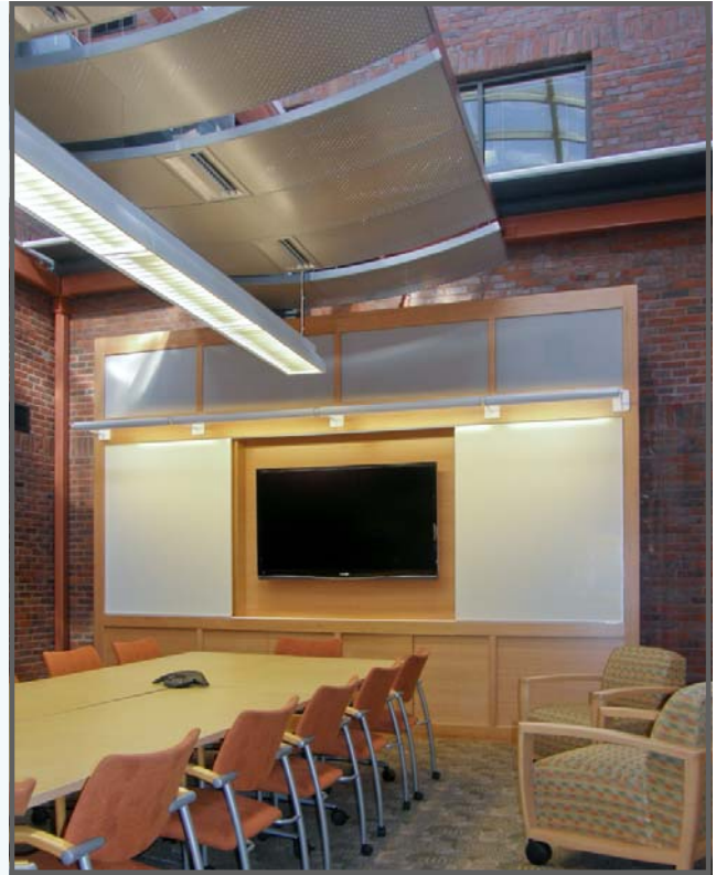
Main Conference Room

In addition to carrying out a LEED renovation, the HUECU, as part of its ongoing commitment to protect the environment, encourages members to purchase more fuel-efficient vehicles through the Green Auto Loan Program. This Loan Program provides auto loans at a reduced interest rate for HUECU members looking to finance a vehicle that gets at least 30 miles-per-gallon (highway).