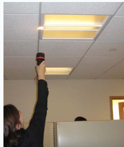
Commissioning: Testing the Daylight Sensors Photo: Perry and Radford Architects. 2008