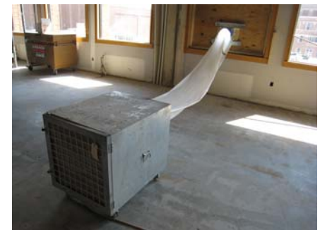
Pathway Interruption: Exhaust filtered and direct to outside