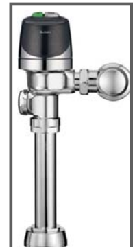
SLOAN ECOS® Electronic Dual Flush (Full Flush 1.6 gpf and Reduced Flush 1.1 gpf)